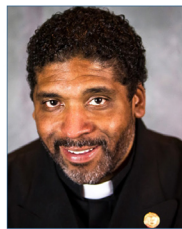
William Barber Professor of the Practice and Director of the Center for Public Theology and Public Policy