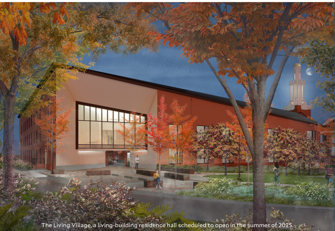
The Living Village, a living-building residence hall scheduled to open in the summer of 2025.