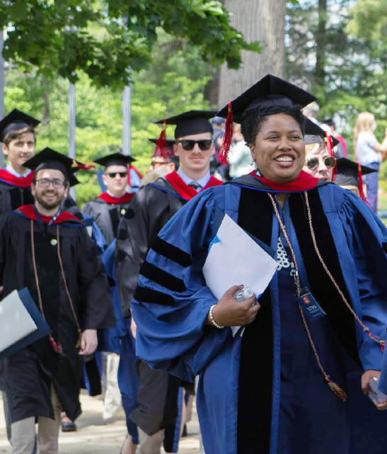
Left: Graduating students process on the YDS campus to the Commencement degree ceremony. Right: Students study in the Trowbridge Reading Room in the Divinity Library