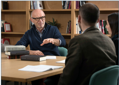
Miroslav Volf, Henry B. Wright Professor of Systematic Theology