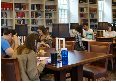
ABOVE: Students study in the Trowbridge Reading Room in the Divinity Library