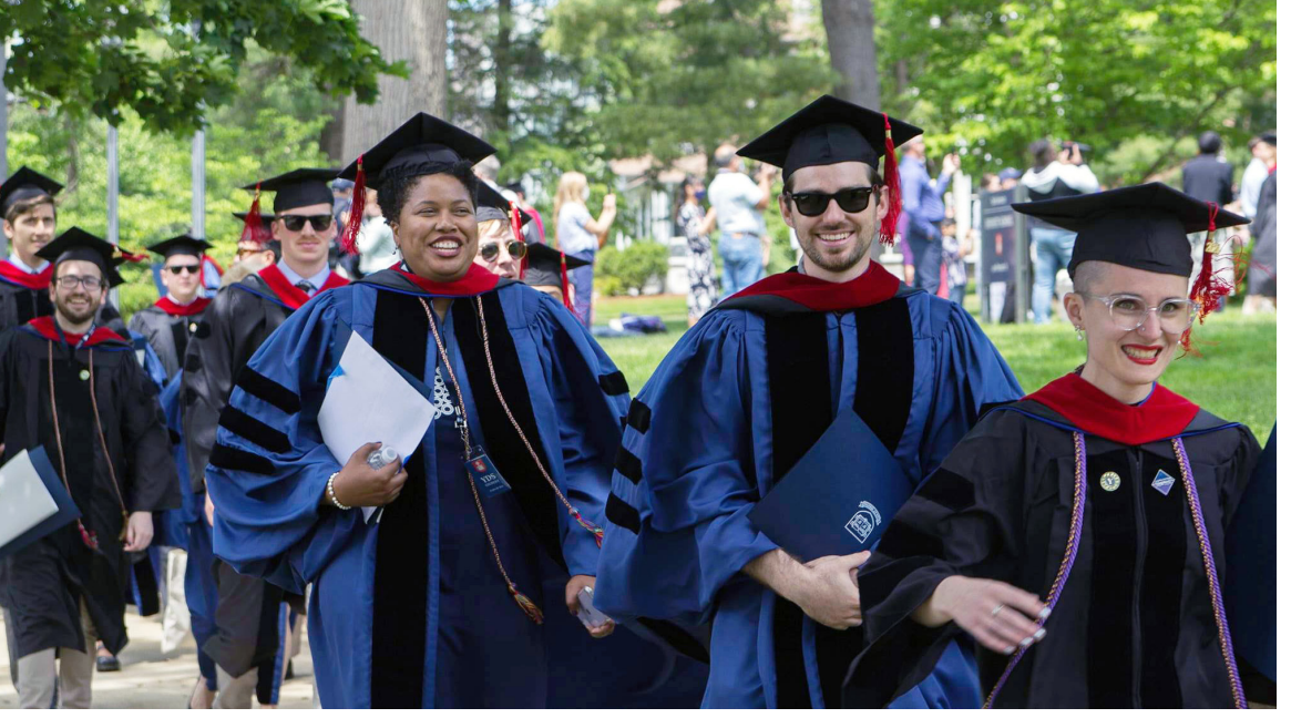
Graduating students process on the YDS campus to the Commencement degree ceremony.