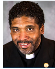
William Barber Professor of the Practice and Director of the Center for Public Theology and Public Policy