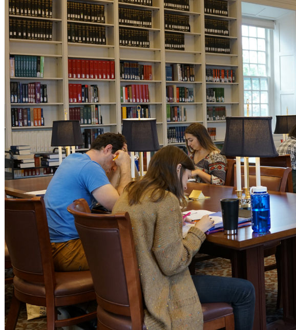
Left: Graduating students process on the YDS campus to the Commencement degree ceremony. Right: Students study in the Trowbridge Reading Room in the Divinity Library