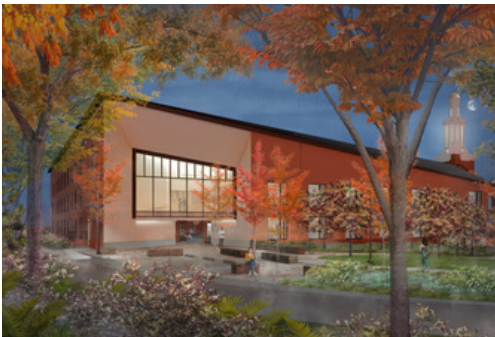
Bauer Hall at The Living Village

Giving back to the environment more than it takes, the newly constructed regenerative living community will be the largest living building residential complex on a university campus. Designed to meet the Living Building Challenge , the most aggressive for sustainable buildings today, this residence will serve as a key component of Yale Divinity School’s sustainable future.